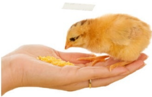
xiǎo jī chī fàn 小鸡吃饭。